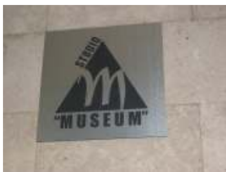
Studio Museum , Bishkek Kyrgyzstan, 2005.

An architectural studio and an offspring of the Paper Architecture movement, Museum is headed by Ulan Djaparov and run by a number of artists who have been active for over ten years. It gathers artists, architects, designers, poets, and other creative individuals into project-based opportunities to create and exhibit both conventional and non-conventional works. It has been especially effective in negating definitions about contemporary art to ensure diversity of thought and practice while encouraging experimentation. Many of its exhibitions have connected artists of different genres from different countries of Central Asia in theoretical and aesthetic investigations. Museum's most valuable curatorial activity is an annual exhibition entitled "Bishkek April Fools Day Competition."