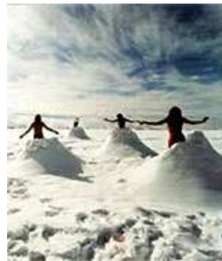
Almagul Menlibayeva, SteppenBaroque Series: Apa (Ancestors) , 2003. Stills from video performances.