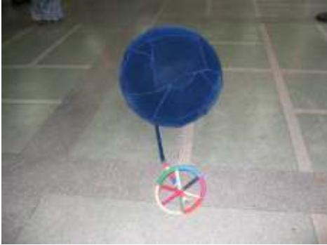
Unknown artist. At "Peace& Respect" Festival, 2004.