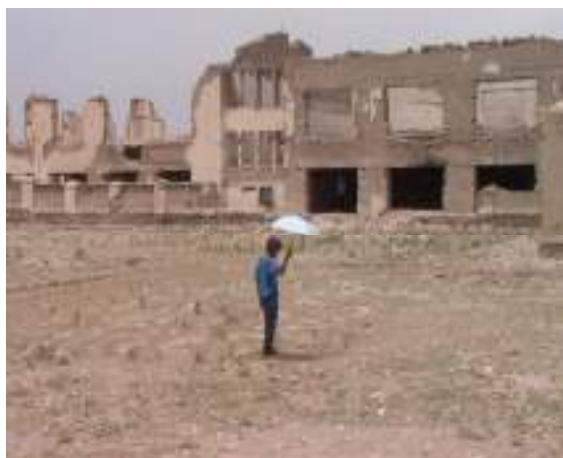
Lida Abdul, White House . Video performance.

Since the unveiling of the Central Asian Pavilion at the Venice Biennale, a number of Central Asian artists have been featured in other recent biennial exhibitions, including the Istanbul Biennial 2005, the Sydney Biennale 2006, and the Singapore Biennale 2006.