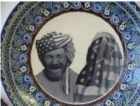
Yerbossyn Meldibekov, Pastan 6 , 2004. Room and wall installation with about 50 plates.

The basic premise for "The Taste of Others" can best be described by a quote from CEC ArtsLink's mission statement: "The arts are a society's most deliberate and complex means of communication, and artists and those who work in the arts can help nations overcome long histories of reciprocal distrust, insularity, and conflict" (CEC ArtsLink Website/About).